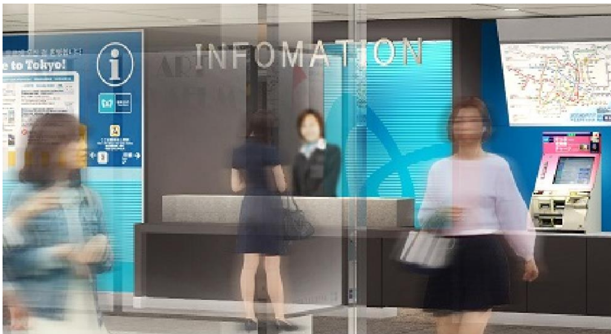
Passenger Information Desk at Ueno Station (image representation)

Please see the Attachment to this release for an overview of this endeavor.